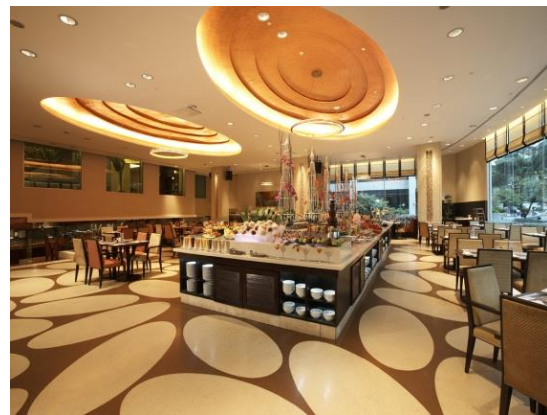
TONKA BEAN CAFÉ

A modern and spacious room at 36sqm for your comfort. Enjoy your buffet breakfast at Tonka Bean Café with Malaysian and International cuisine.