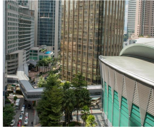
DIRECT LINK TO KL CONVENTION CENTRE (KLCC) VIA THE SKYBRIDGE

Located in the heart of the Kuala Lumpur (KL) City Centre, Impiana KLCC Hotel is positioned among the majestic Petronas Twin Towers and the ultra-modern Kuala Lumpur Convention Centre.